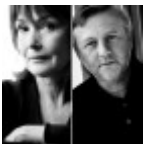
Sandin & Bülow